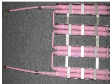
4/MINI BANK HEATERS